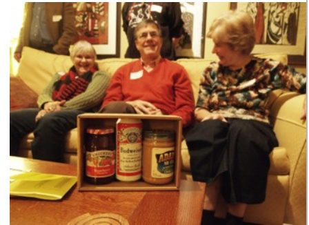
Peace Corps survival: PB&J and Budweiser.

wine, and engaged in a Dirty Santa gift exchange with the theme of "Peace Corps Survival" that allowed for stealing other people's presents. The members present proved to be extremely polite, and toilet paper was observed to be a unifying survival tool across regions and years of service. It's nice to know some things haven't changed! Other popular Peace Corps survival gifts included: books for all of that down time, a map of Mongolia, toys and games from Mexico, beer from Thailand and a particular scarf from Ghana, to name a few.